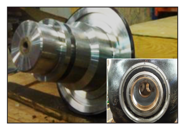
Equipment showing internal housing and runner blade.

Customer needed to get back online in the quickest possible timeframe.