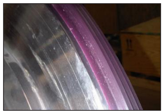
Seal shown installed onto the runner blade hardware.